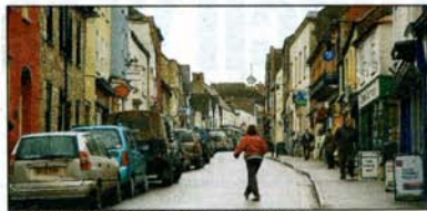
Wotton-under-Edge High Street GMW227H10

Do you feel we are out of recession? Let us know at gazetteseries.co.uk/news