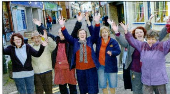
Traders in Dursley high street

"I think we have to be optimistic for the coming year with Sainsbury's arriving and also Iceland coming to the town," she said.